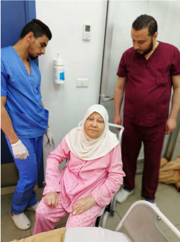
Measuring the weight of the patient