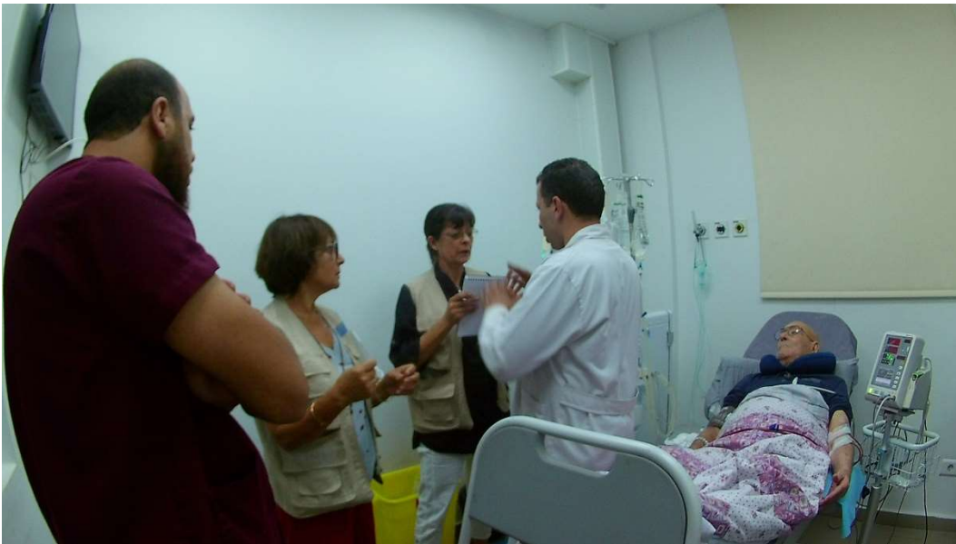
Training at KCU- Beddawi camp