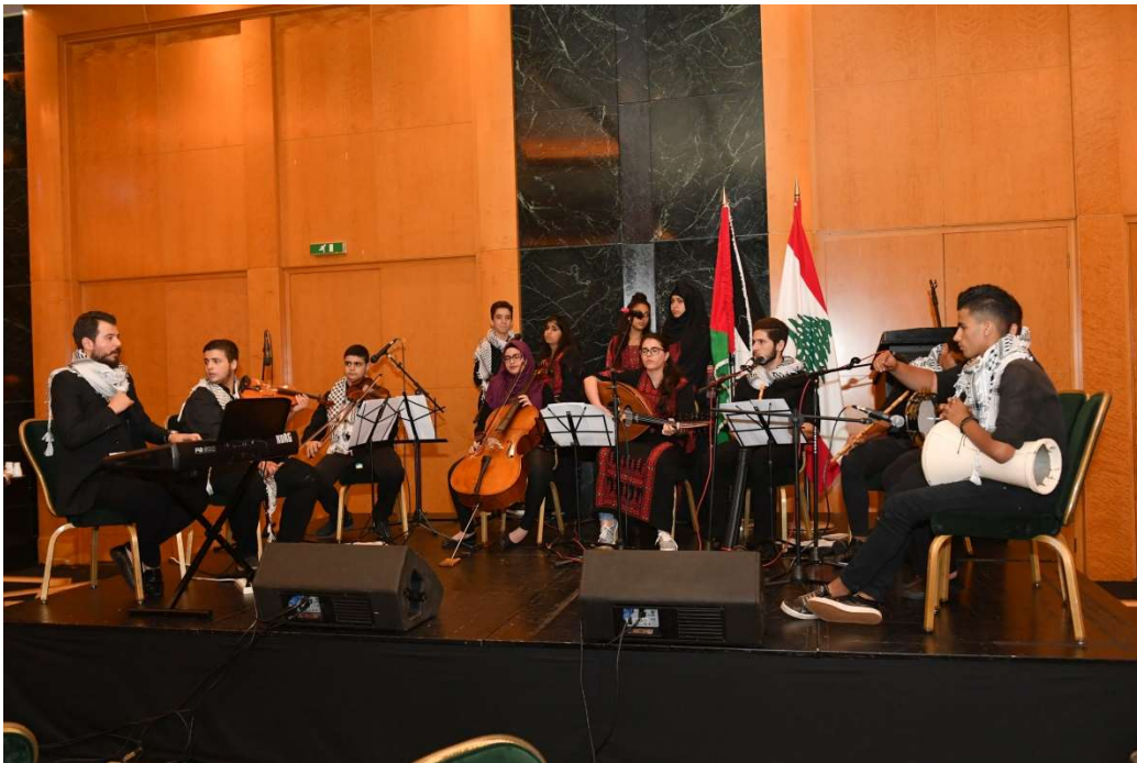
Al Kamanjati band from Beit Atfal Assomoud, as usual performed their best of folklore songs