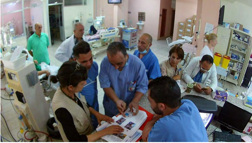
Training at Haamshari dialysis center