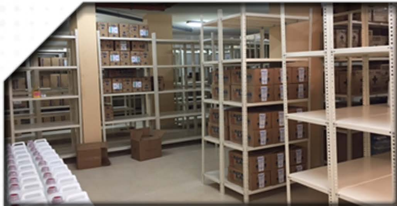
Ware house at KCU for the MIKP and kidney dialysis consumables

During the year 2019, HCS received 5 shipments of medications and medical supplies. These were distributed to clinics and hospitals in the camps according to the needs, to be provided to the beneficiaries for free.