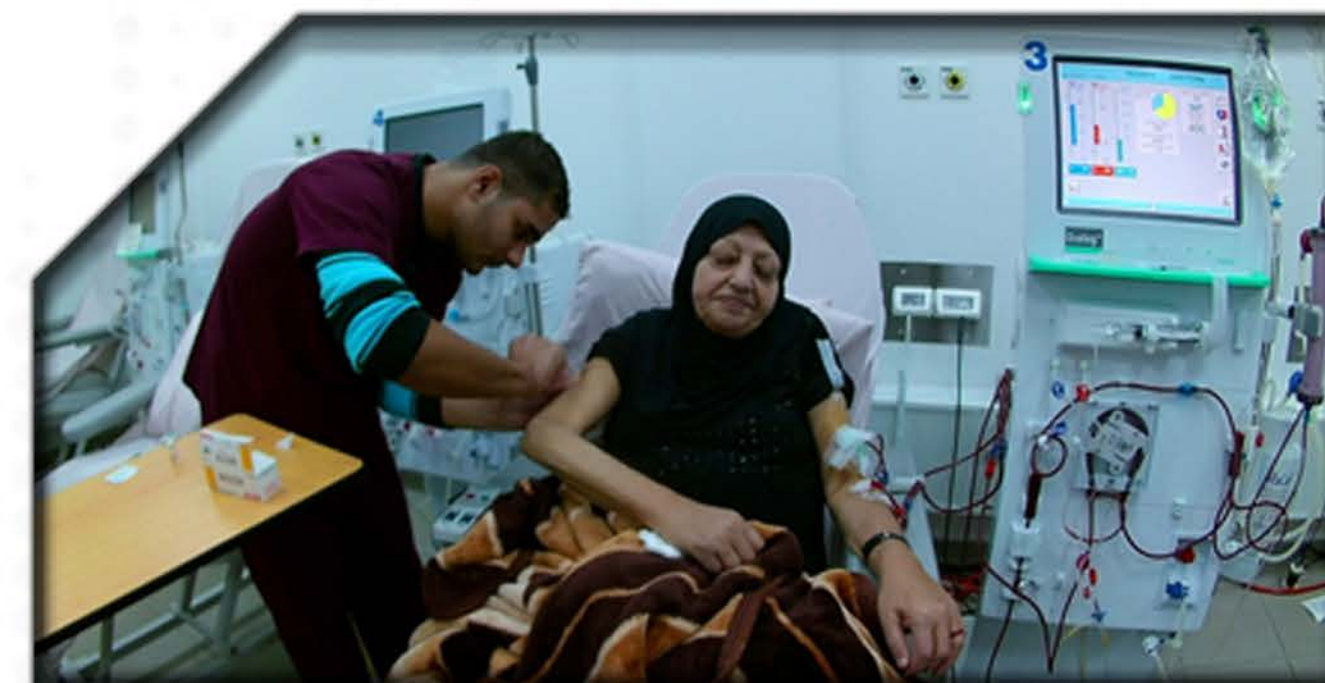
Receiving epoetin injection after the dialysis session treatment