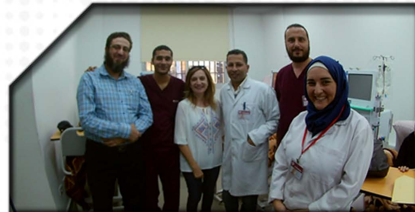
Meeting of HCS staff with the medical team at KCU

The center performed 4967 dialysis sessions in 2019. Total number of recurrent patients per year is 411, 69% are males & 31% are females. All patients received epoetin injections for anemia gratis a generous donation from NORWAC.