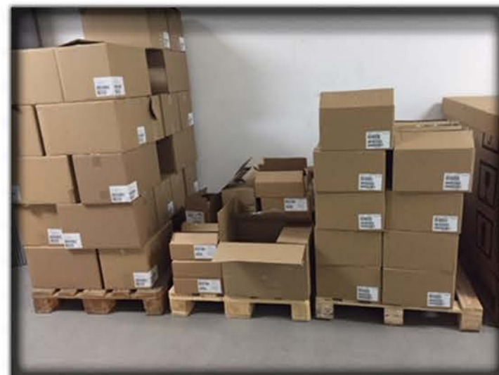
Medical supplies at YMCA warehouse, ready to pick up.

The number of clinics that benefit from this program is 15 and 6 hospitals.